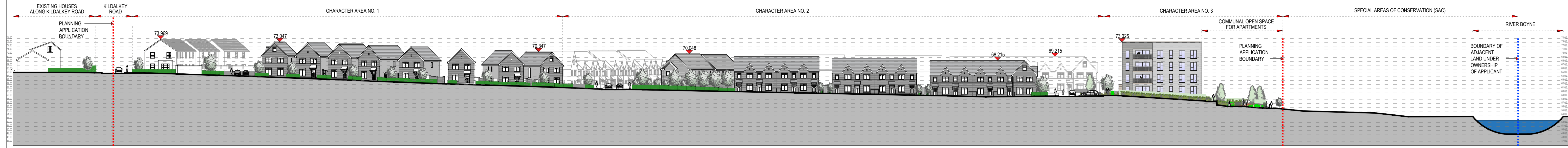
SITE SECTION A-A' Scale 1:500

COPYRIGHT THIS DOCUMENT AND ALL DATA CONTAINED HEREIN REMAIN THE PROPERTY OF O'DALY ARCHITECTS. IT IS SUPPLIED IN CONFIDENCE FOR EVALUATION PURPOSES ONLY UNDER THE CONDITION THAT SAME IS NOT USED, REPRODUCED OR TRANSMITTED IN ANY WAY TO OTHERS WITHOUT WRITTEN CONSENT. DIMENSIONS UNLESS OTHERWISE STATED, DIMENSIONS SHOWN ARE IN MILLIMETRES. NO DIMENSIONS TO BE SCALED FROM THIS DRAWING. ALL DIMENSIONS TO BE CHECKED BY THE CONTRACTOR ON SITE AND ANY DISCREPANCIES TO BE REPORTED TO THE ARCHITECT.